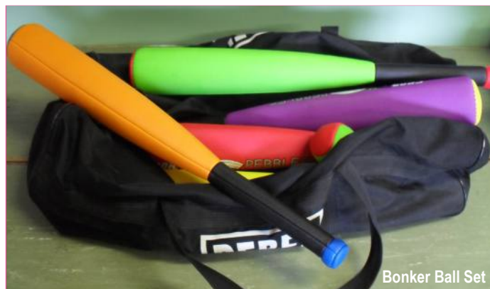
Bonker Ball Set